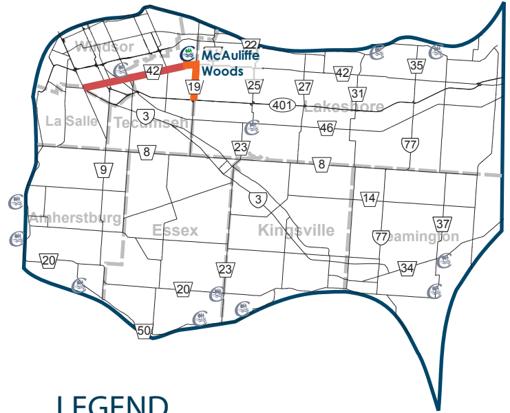
Conservation Area Map

Exit the 401 at County Rd 19, head North for 4 km. Turn left (West) on County Rd 42, go .25 km. Turn right (North) on St. Alphonse St., go .7 km. You will see the entrance to McAuliffe Woods on the West side.