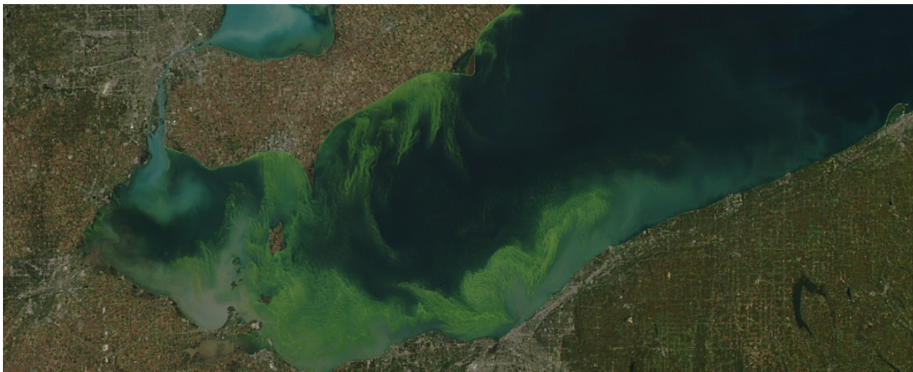
Left: A NASA satellite image of blue-green algae blooms in Lake Erie, October 2011.