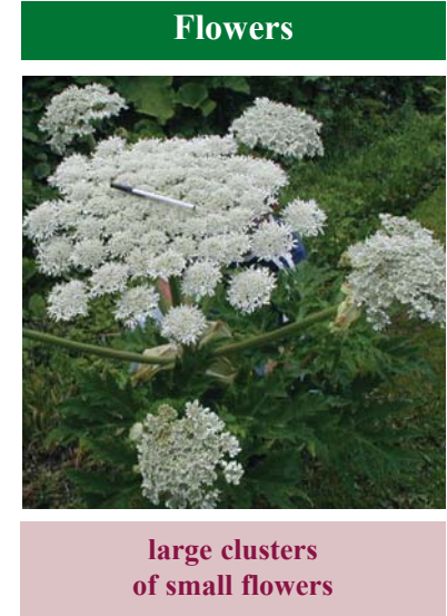
large clusters of small flowers